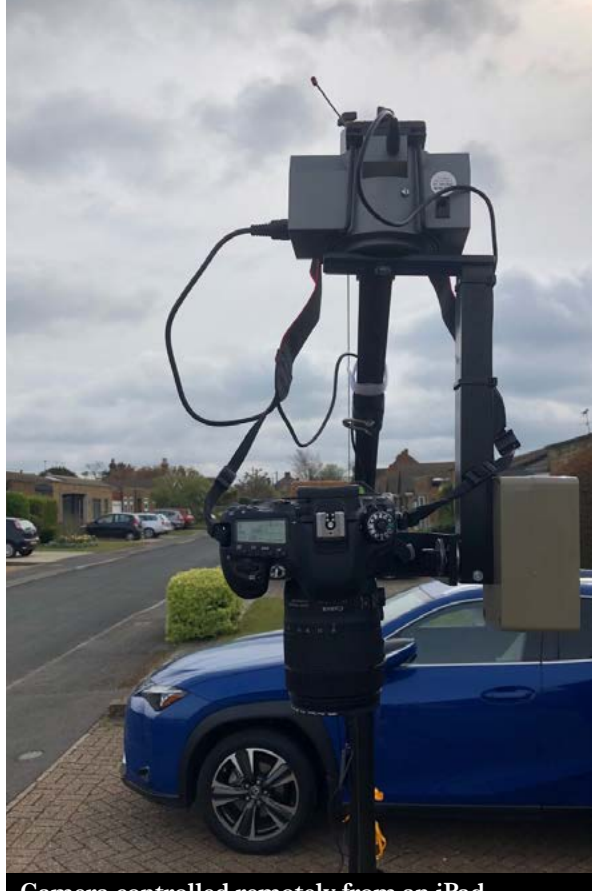
Camera controlled remotely from an iPad